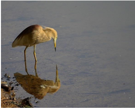
Indian Pond Heron