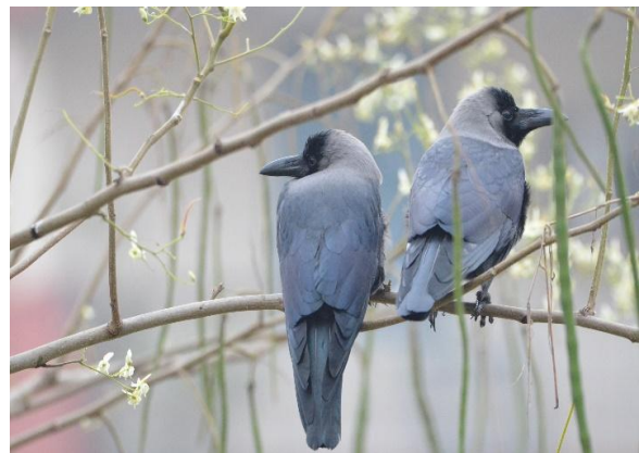
Common house crow