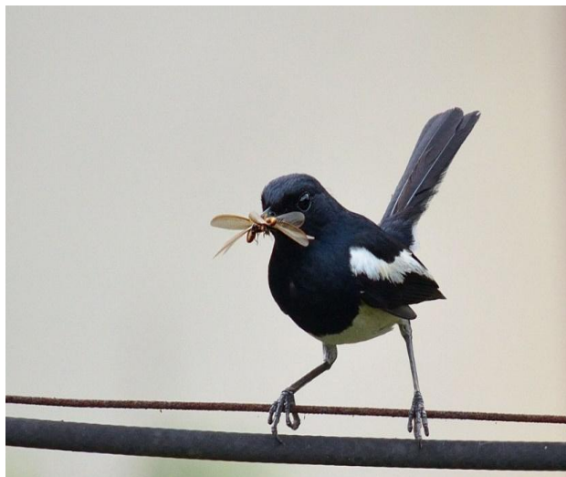
Oriental Magpie Robin