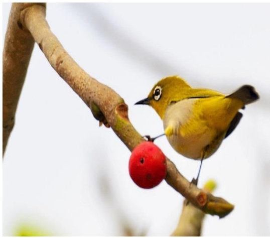
Indian white eye