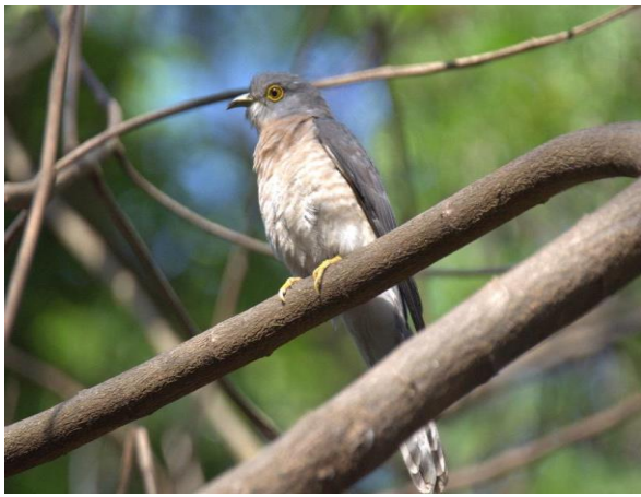
Common Hawk Cuckoo