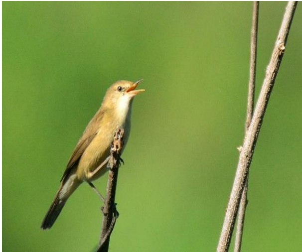
Blyth's Reed Warbler