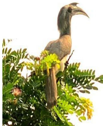
Indian Gray Hornbill