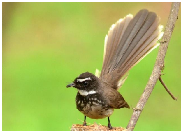
Spot Breasted Fantail