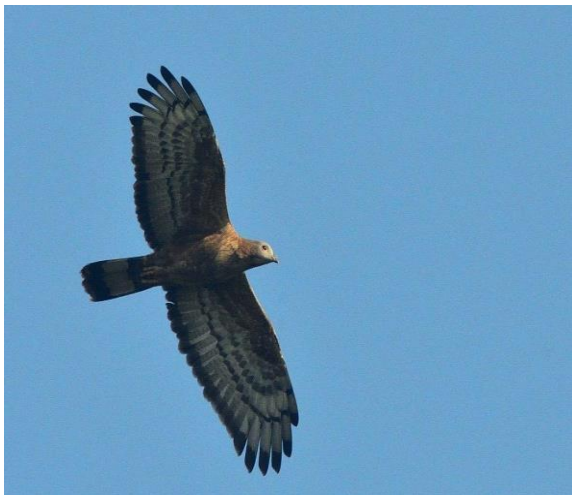
Oriental Honey Buzzard