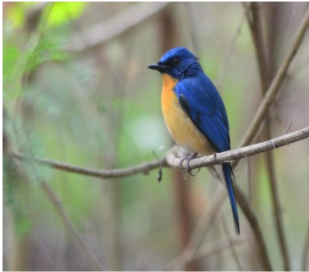
Tickell's Blue Flycatcher