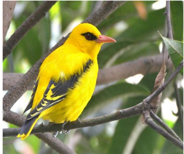
Indian golden oriole