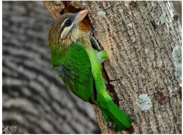
white cheeked barbet