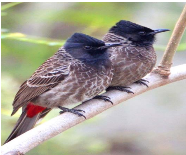
Red Vented Bulbul