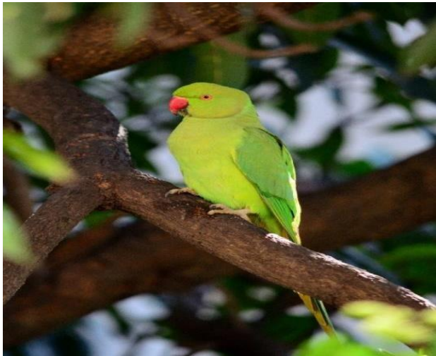
Rose ringed parakeet